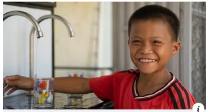
VIETNAMNEWS.VN Rural school clean water programme continues in Quảng Nam

Nếu bạn yêu thích và muốn ủng hộ những dự án mà Lifestart Foundation đang thực hiện, bạn có thể quyên góp, tham gia làm thành viên hàng tháng, hoặc tổ chức 1 sự kiện gây quỹ cho chúng tôi. www.lifestartfoundation.org.au