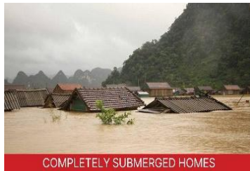
COMPLETELY SUBMERGED HOMES