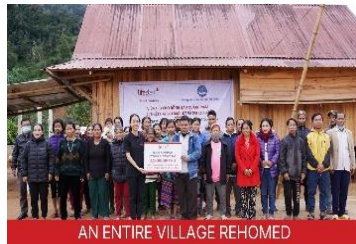
AN ENTIRE VILLAGE REHOMED