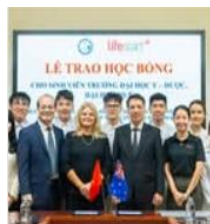
VIETNAMNEWS.VN Students get medical scholarships Lifestart Foundation (Australia), a non-governmental organisation, has recently awarded a new round of prestigious Medicine, Pharmacy...

A special #THANKYOU to Việt Nam News for featuring and acknowledging this special project in your newspaper.