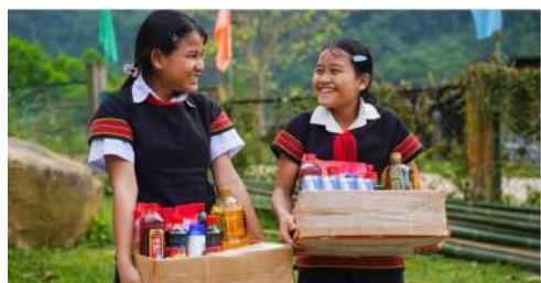
VIETNAMNEWS.VN Disadvantaged students and families get Tết gifts