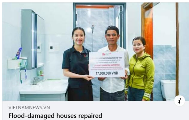
VIETNAMNEWS.VN Flood-damaged houses repaired

A big #THANKYOU to Việt Nam News for featuring and acknowledging this special project in your newspaper.